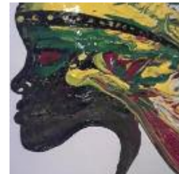
Painting by an ART House client

We also collaborate with Van Ness House where we've worked on developing culturally appropriate and identity-affirming policies and procedures. We cross-refer people to and from our programs.